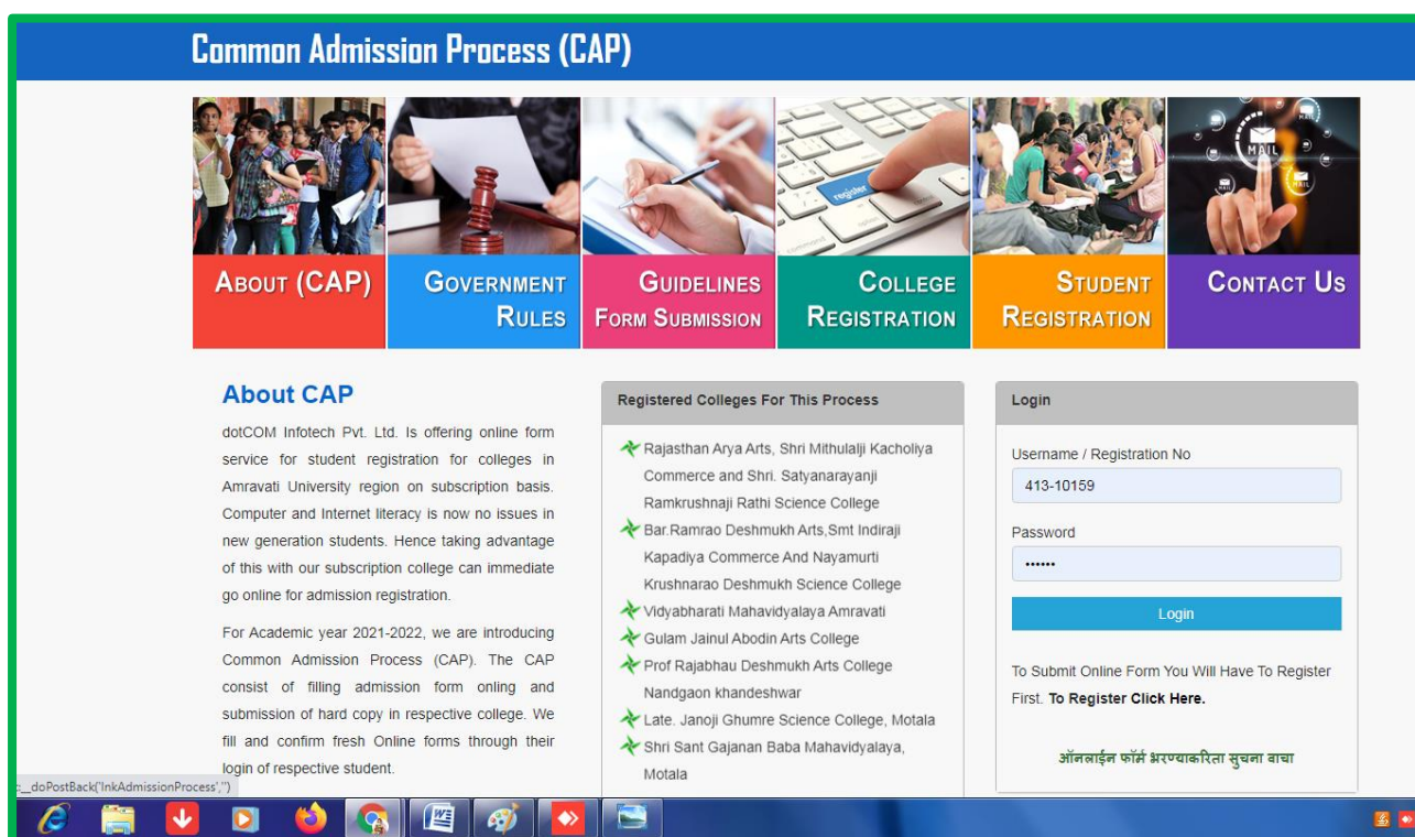
Screenshot of Online Admission Portal of the college